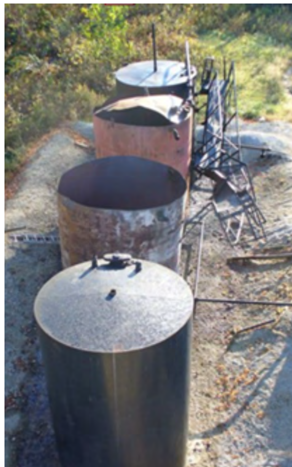
CSB MAR Oil investigation, 2008

The CSB has found that explosions and fires caused by hot work are among the most common incidents it investigates. These incidents typically result in injuries and fatalities and have the potential to result in a major catastrophic incident.