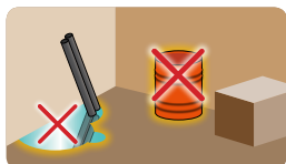
Analyze the Hazards

2. Analyze the Hazards – Prior to the initiation of hot work, perform a hazard assessment that identifies the scope of the work, potential hazards, and methods of hazard control.