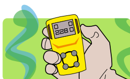
Monitor the Atmosphere

3. Monitor the Atmosphere – Conduct effective gas monitoring in the work area using a properly-calibrated combustible gas detector prior to and during hot work activities, even in areas where a flammable atmosphere is not anticipated.